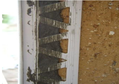
PTT - Render Trims bedded onto wall