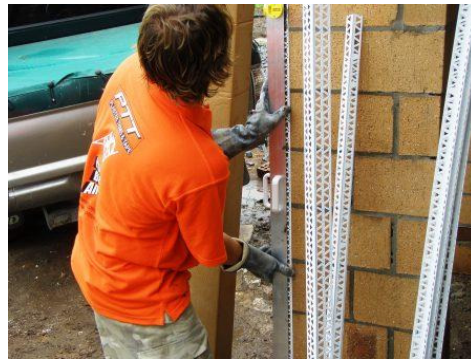
Place PTT Trim on the external corner using the PTT Trim Applicator moving the Applicator up and down to create a suction effect