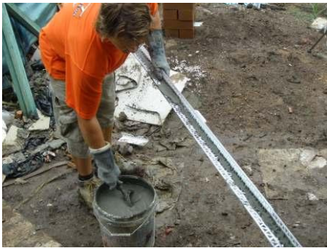
Lay the PTT Trim in the PTT Trim Applicator and cover with patch render