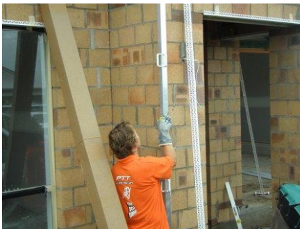
Make sure the PTT Trim is straight and true using the built in level and straightedge on the PTT Trim Applicator